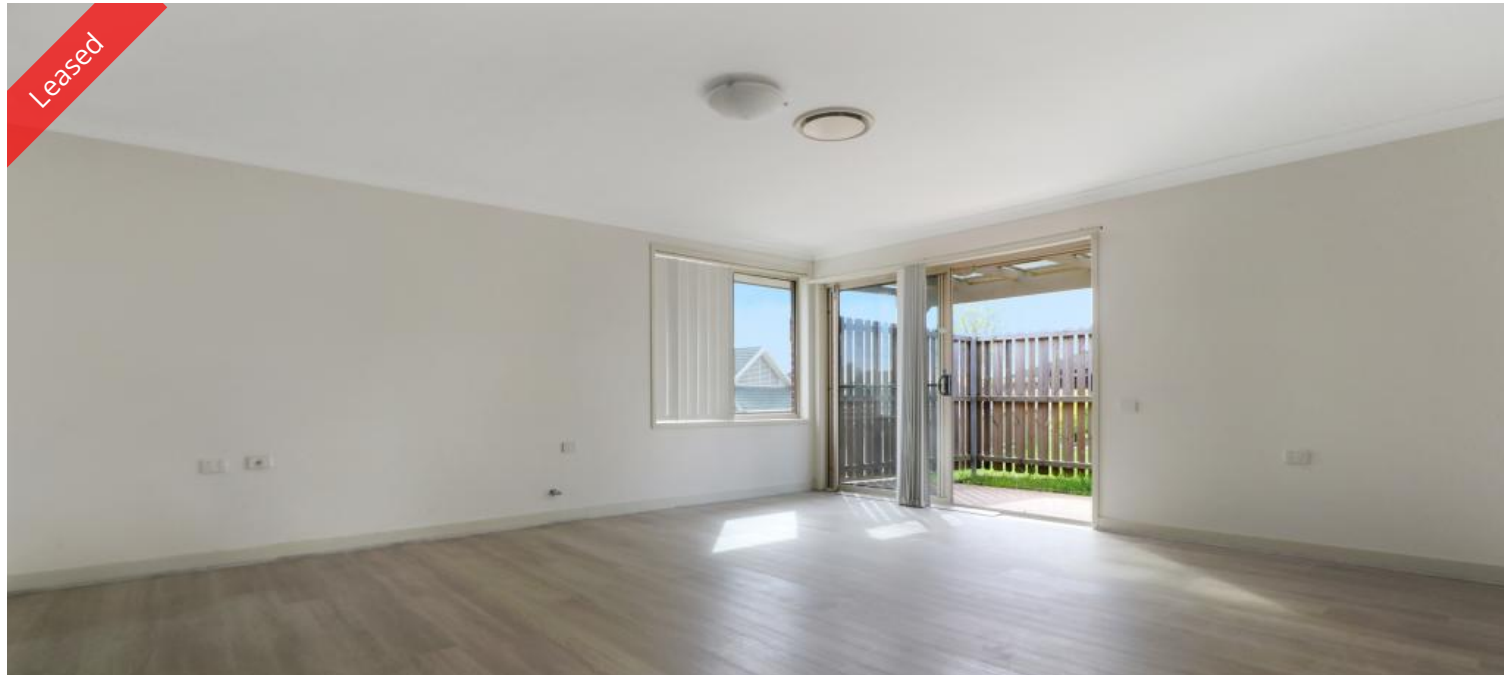
Unit 10, 359 Narellan Rd, Currans Hill