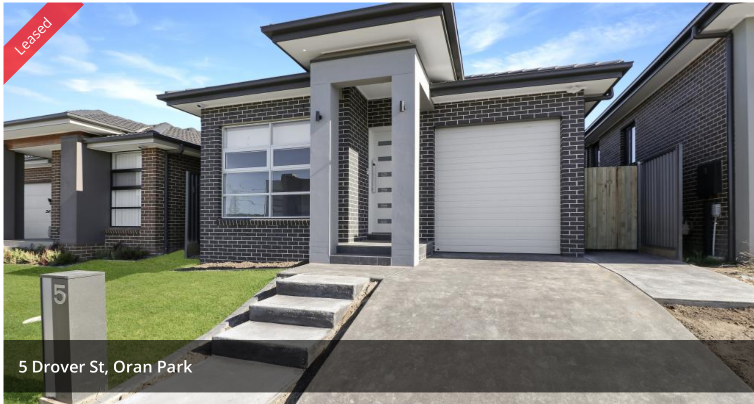
5 Drover St, Oran Park