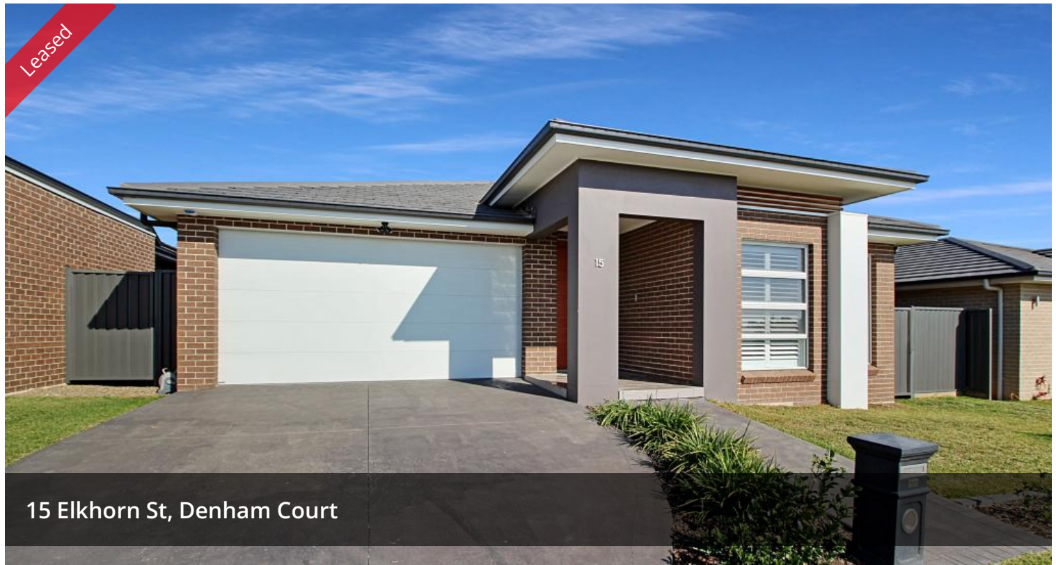
15 Elkhorn St, Denham Court